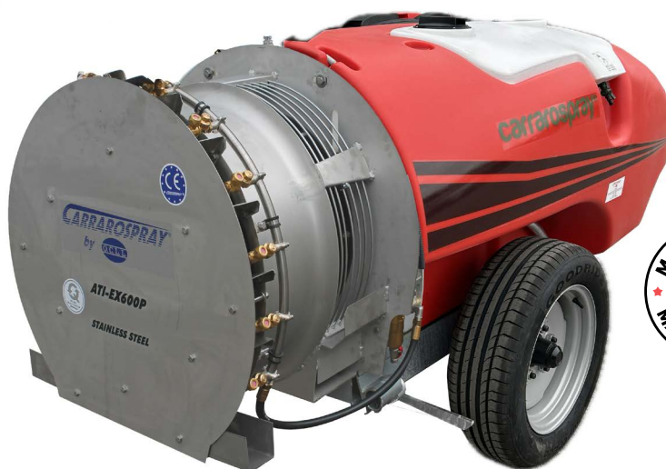
FRONT CLEAN JET ATI-EX 600-700-800 L