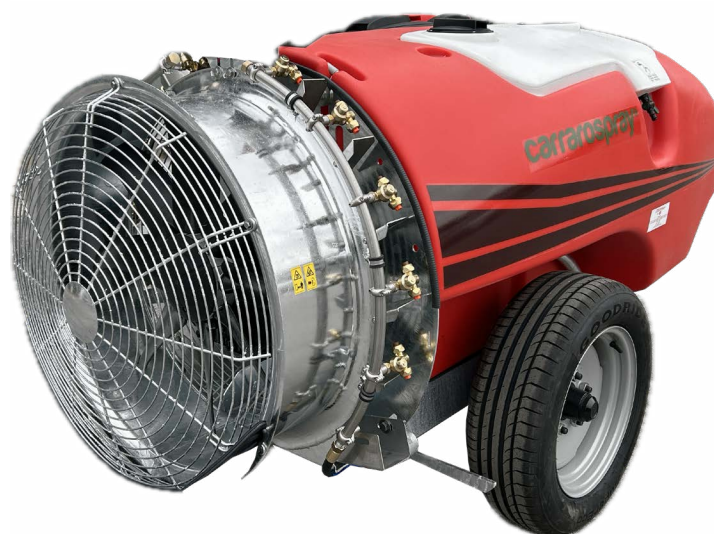
MAXI JET ATP-EX 600-800-1000-1500 L