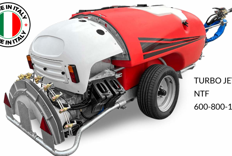
TURBO JET NTF 600-800-1000 L