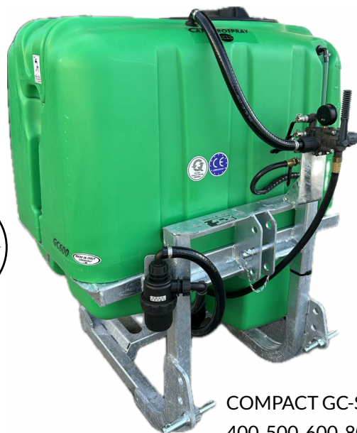
COMPACT GC-S 400-500-600-800-1000 L