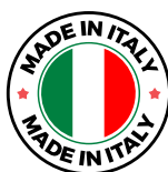
OLIVIA CROP APTL-S 300-400-500-600 L