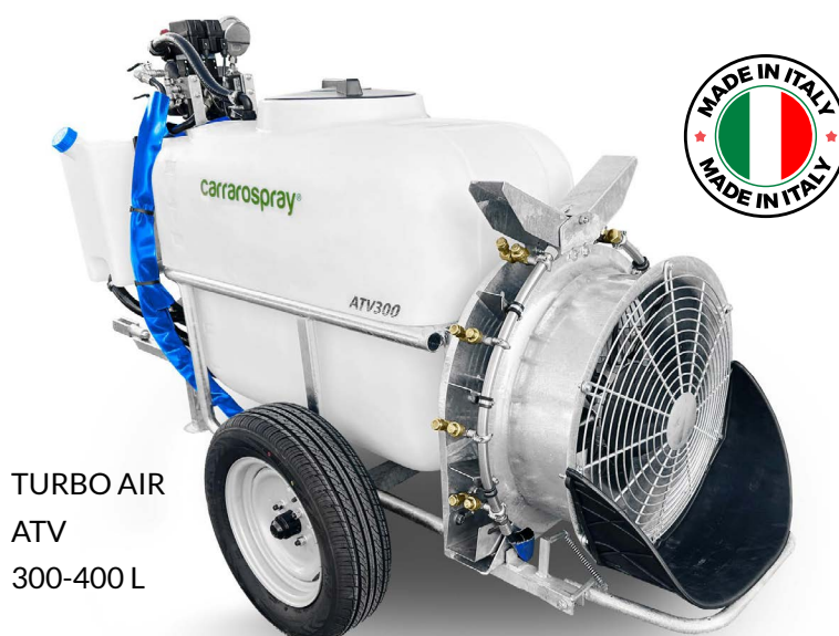
TURBO AIR ATV 300-400 L