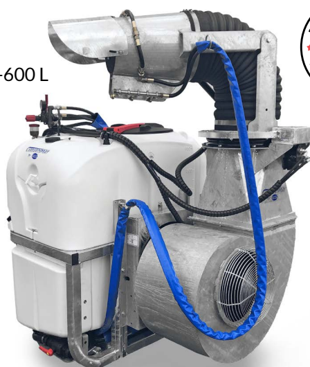
OLIVIA FLEXI APTL-F 300-400-500-600 L