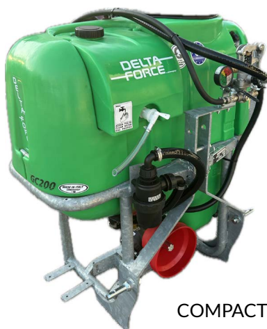
COMPACT GC-S 200-300 L