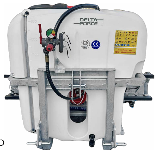
FIELD PRO GC-BD 400-600-800-1000 L